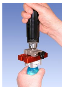
Masurare deschidere capace cu sistem mobil