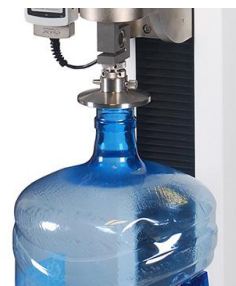
Masurare compresiune frontala