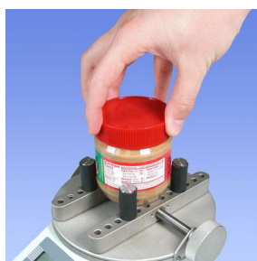
Masurare deschidere capace cu sistem fix