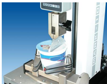
Testare dezlipire capac folie