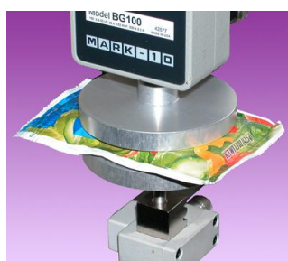
Testare spargere ambalaje ermetice