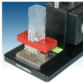
Testare extragere capace